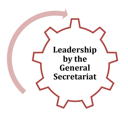
Figure (2) The executive bodies of the national action plan for the issue of skills development

As for the main partners (at the level of leadership and implementers), they were assigned according to what is shown in the structure embodied in the following figure (2), to implement the plan shown in Table (3):